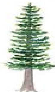
PACIFIC SILVER FIR