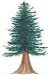
WESTERN RED CEDAR