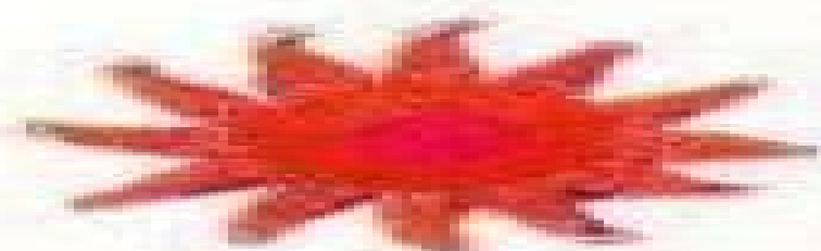
Spiny Sun Star