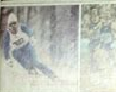
The Olympic Games