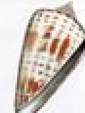
Alphabet Cone (CB)

Cerithium californicum To 1.8 in. (4.5 cm) Spiral high-spired shell is common on intertidal flats in estuaries and bays. Can climb trees and be out of water for extended periods.