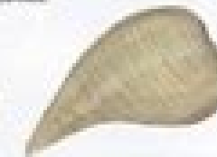
Common Fig Shell (CB)

Hydrobia ulitiformis To .75 in. (2 cm) Very fragile white to yellowish shell has a delicate lip. Shells are so light they are often transported to the highest tide line.