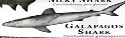
GALAPAGOS SHARK Carcharias galapagensis