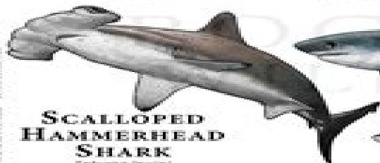
SCALLOPED HAMMERHEAD SHARK Sphyrna tiburo