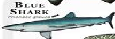
BLUE SHARK Prionace glauca