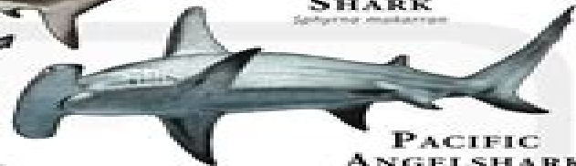
GREAT HAMMERHEAD SHARK Sphyrna makaroran