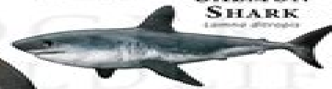
SALMON SHARK Lamna ditropis