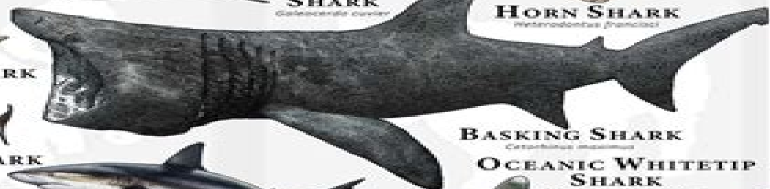
BASKING SHARK Cetorhinus maximus