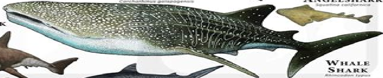
WHALE SHARK Phaenodon typus