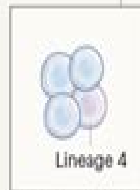
Tumour evolution tracked over time