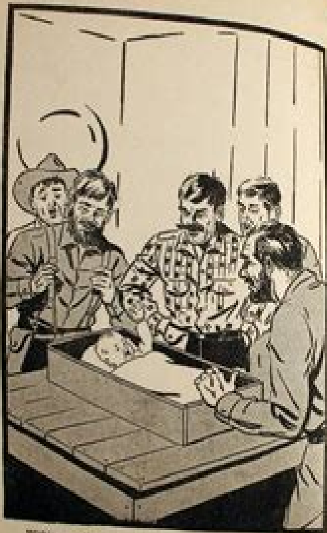
Within a candle box, wrapped in red flannel, lay the latest arrival at Roaring Camp.