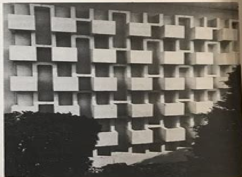
Something different is achieved by setting blocks to protrude from the wall. This wall combines 8x8x16 inch, 4x8x16 inch, and lintel units. (National Concrete Masonry Assn.)