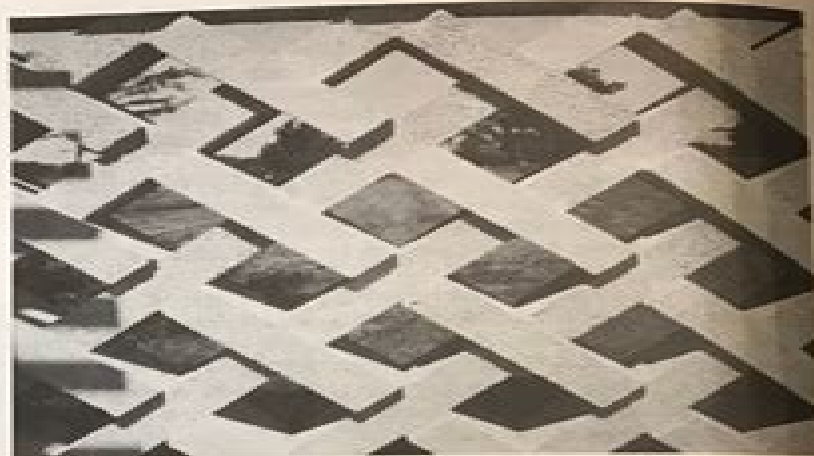
An open screen fence created by laying conventional concrete brick diagonally in a basketweave pattern.