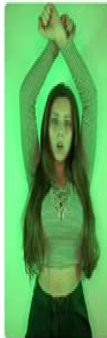
IT'S SHOW TIMEEEE