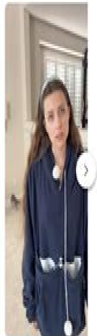
DEWM MEGA CHINCHILLA CAGE ...