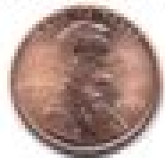
A regular unplated penny