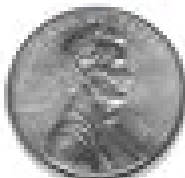
A similar penny plated in nickel.