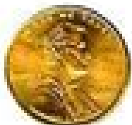
Another penny plated in gold