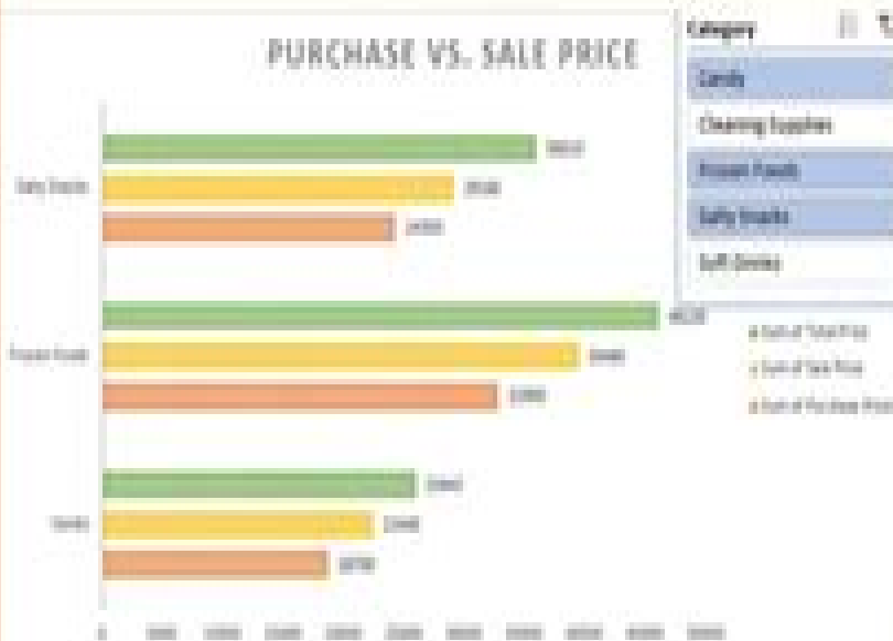
PURCHASE VS. SALE PRICE