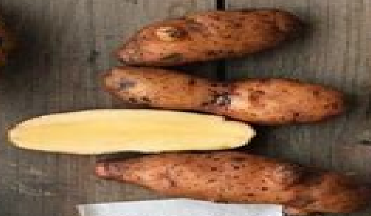
PINK FIR APPLE