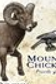
ROCKY MOUNTAIN BIGHORN SHEEP Ovis montanus