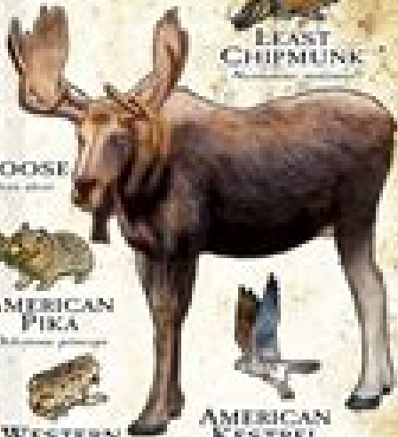
MOOSE Alces alces