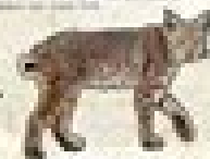
BOBCAT Lynx baileyi