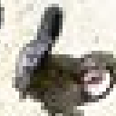
DUSKY GROUSE Phasianus obscurus