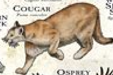
COUGAR Panthera concolor