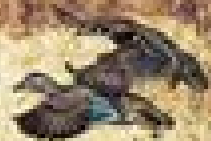
WOOD DUCKS Carex acuta