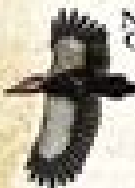
NORTHERN GOSHAWK Accipiter gentilis