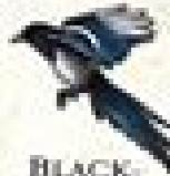
BLACK-BILLED MAGPIE Pica hudsonia