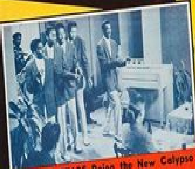
THE FIVE STARS Doing the New Calypso