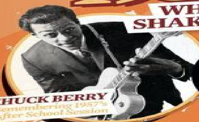
CHUCK BERRY Remembering 1957's After School Session