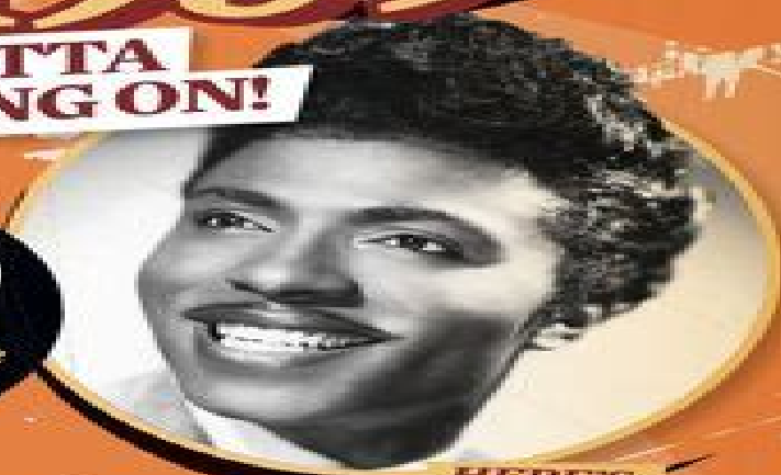
HERE'S LITTLE RICHARD Behind the scenes of a rock'n'roll classic

PLUS Carl Perkins ★ The Rock 'n Roll Trio ★ Billy Lee Riley ★ Cliff Richard ★ And more!