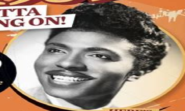
HERE'S LITTLE RICHARD Behind the scenes of a rock'n'roll classic