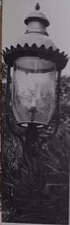
The lamp was like this.