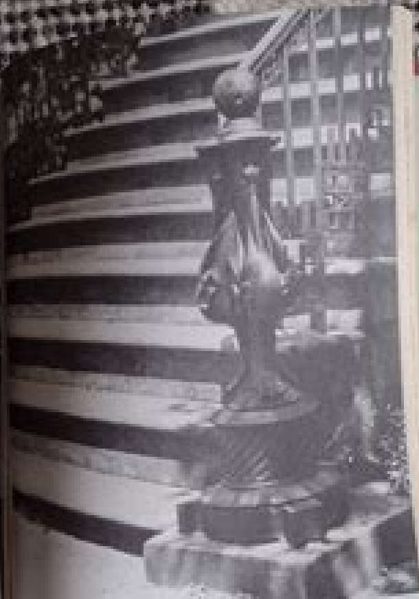
Can you please send me a photograph of the fountain at the John L. L. House, and Takes home.