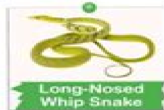
Long-Nosed Whip Snake