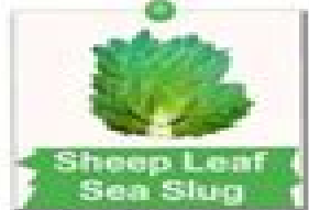
Sheep Leaf Sea Slug