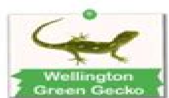
Wellington Green Gecko