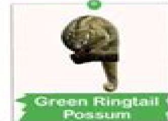
Green Ringtail Possum