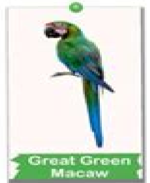
Great Green Macaw