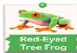
Red-Eyed Tree Frog