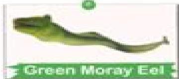
Green Moray Eel