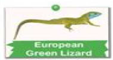
European Green Lizard