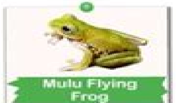
Mulu Flying Frog