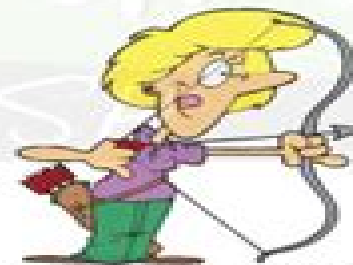
TIRO CON ARCO