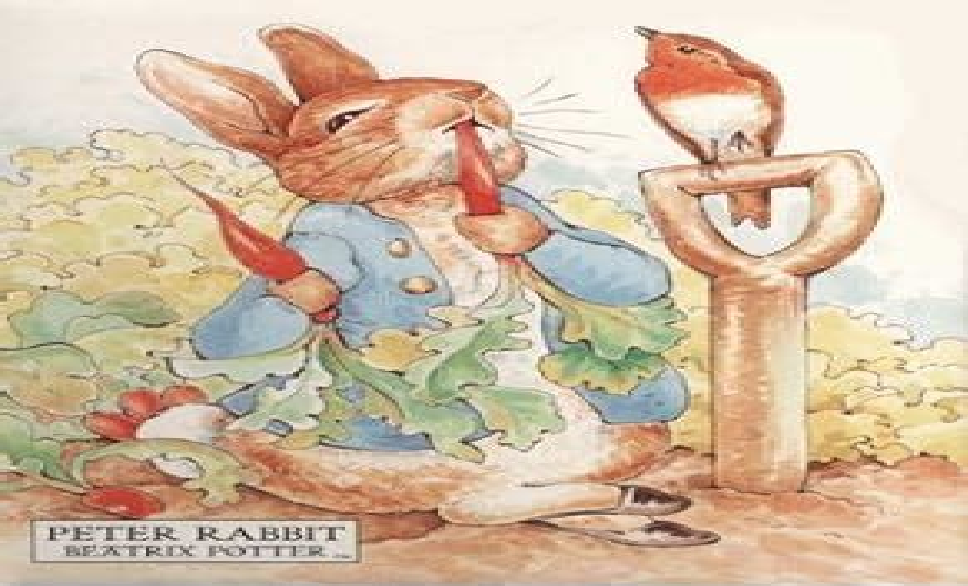
PETER RABBIT BEATRIX POTTER