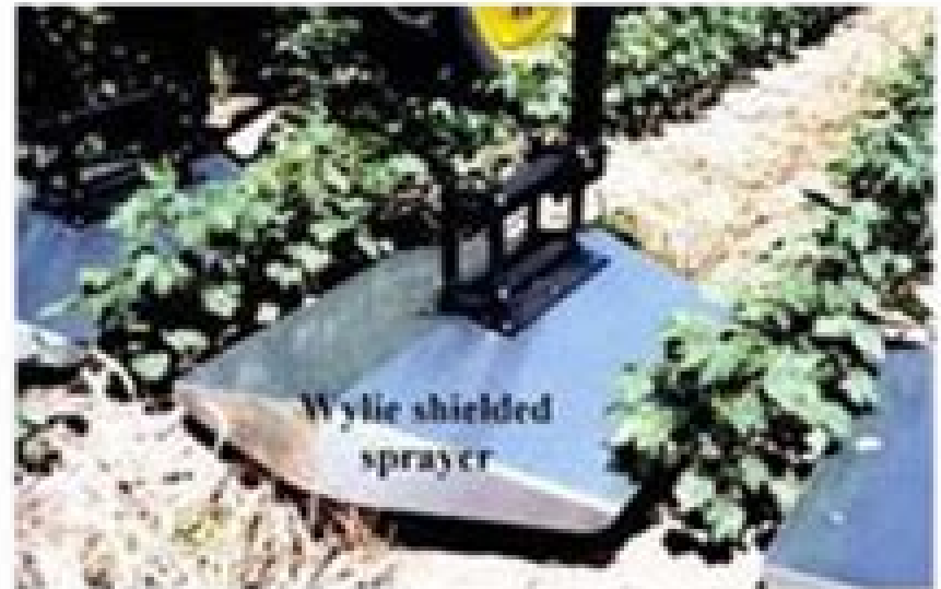
Post-emergence directed (Wylie Sprayers)