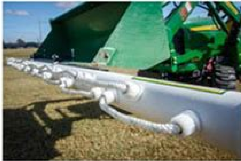
Rope-wick applicator (Rogers Sprayers)