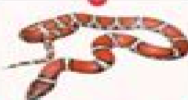
Red Milk Snake