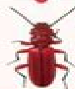
Red Flat Bark Beetle