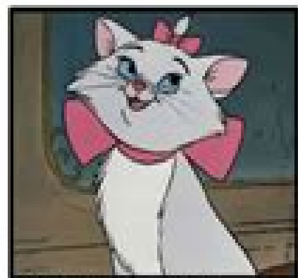
Goliath the Chihuahua