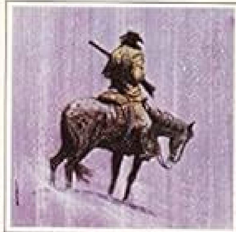
Illustration by [illegible]