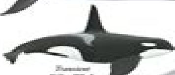
Transient Killer Whale