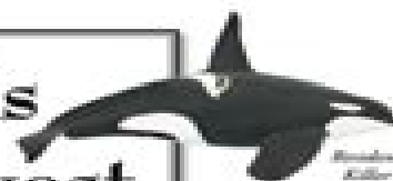
Resident Killer Whale