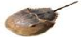
Atlantic Horseshoe Crab