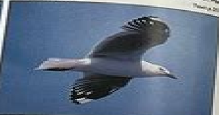
(384) Silver Gull Larus argentatus