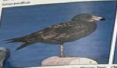
(379) Pacific Gull Larus pacificus