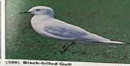
(388) Black-billed Gull Larus bulleri