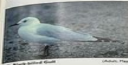
(385) Black-billed Gull Larus bulleri