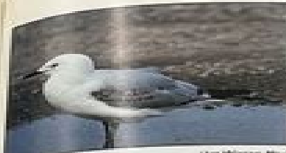
(381) Silver Gull Larus argentatus