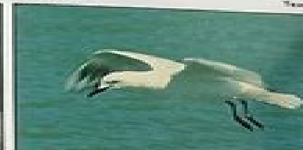
(390) Black-billed Gull Larus bulleri