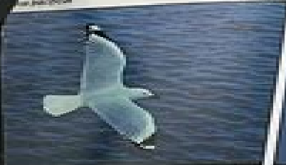
(381) Silver Gull Larus argentatus