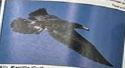
(380) Pacific Gull Larus pacificus