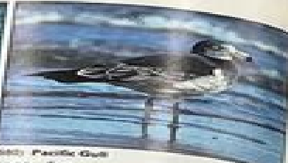
(Adult Summer, Jay) Text p.237