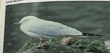
(385) Black-billed Gull Larus bulleri