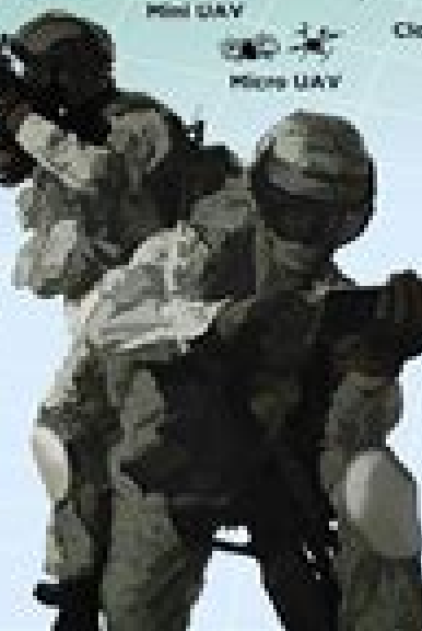
Next-Gen Infantry Battalion