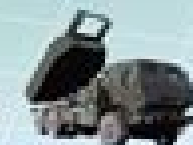
High Mobility Artillery Rocket System