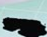
Next-Gen Armoured Tracked Carrier