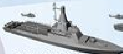
Independence-class Littoral Mission Vessel