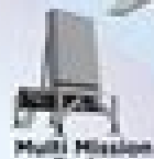
Multi Mission Radar