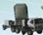
TPQ-53 Weapon Locating Radar