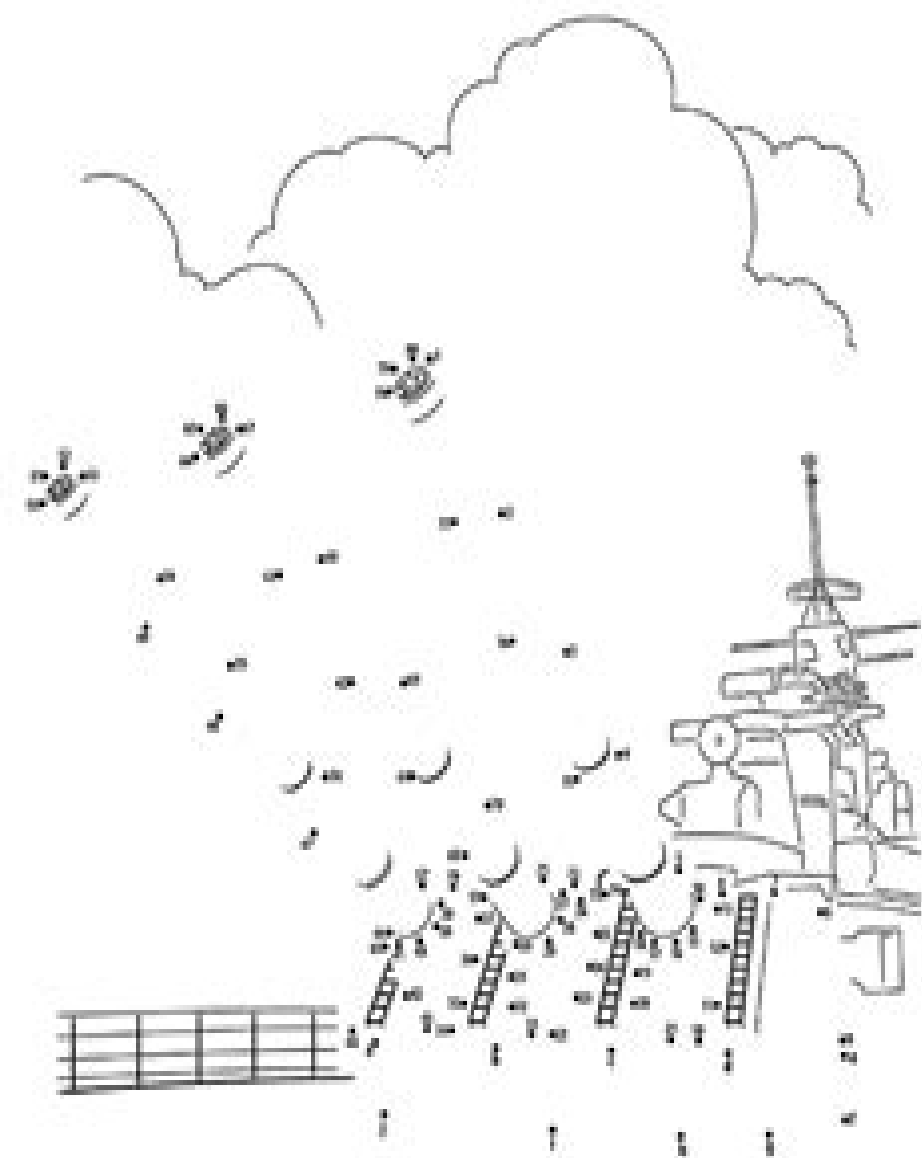
GUN TURRETS ON THE DECK OF THE USS MISSOURI