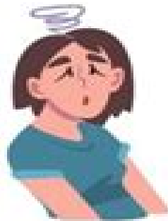
ALTERED STATE OF CONSCIOUSNESS