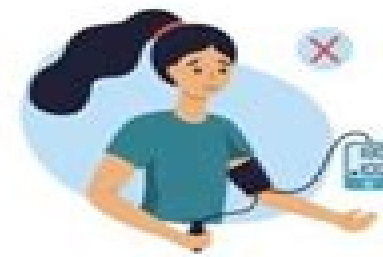
HIGH BLOOD PRESSURE