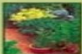
SEASONAL PLANT LISTS

A practical guide to gardening throughout the year