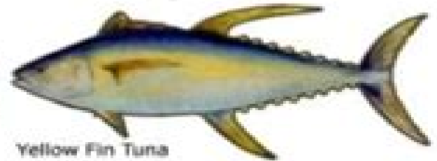
Yellow Fin Tuna