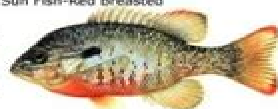
Sun Fish-Red Breasted