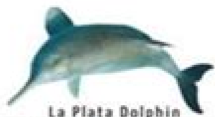
La Plata Dolphin