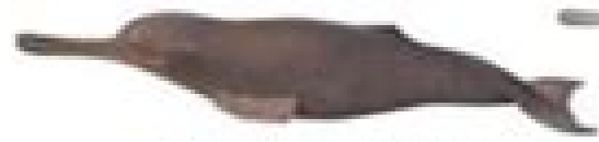
Indus River Dolphin