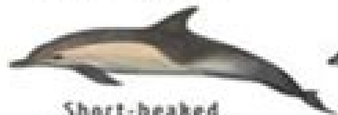
Short-beaked Common Dolphin