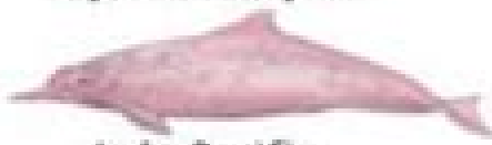
Indo-Pacific Humpback Dolphin