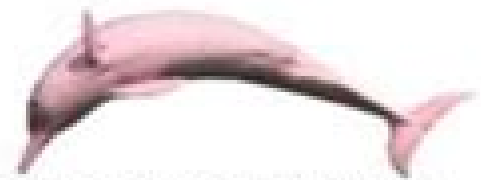
Amazon River Pink Dolphin