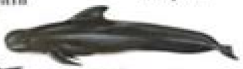
Short-finned Pilot Whale