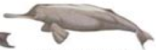
Ganges River Dolphin