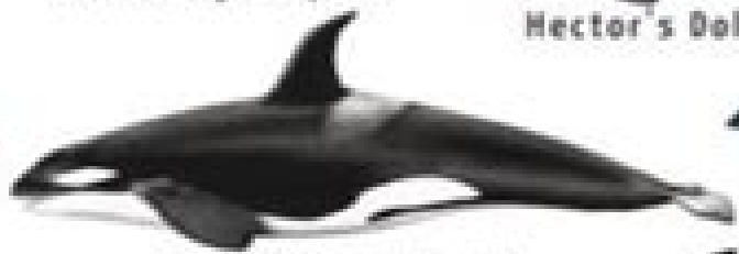
Orca (Killer Whale)