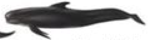
Long-finned Pilot Whale