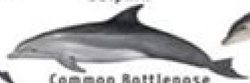
Common Bottlenose Dolphin