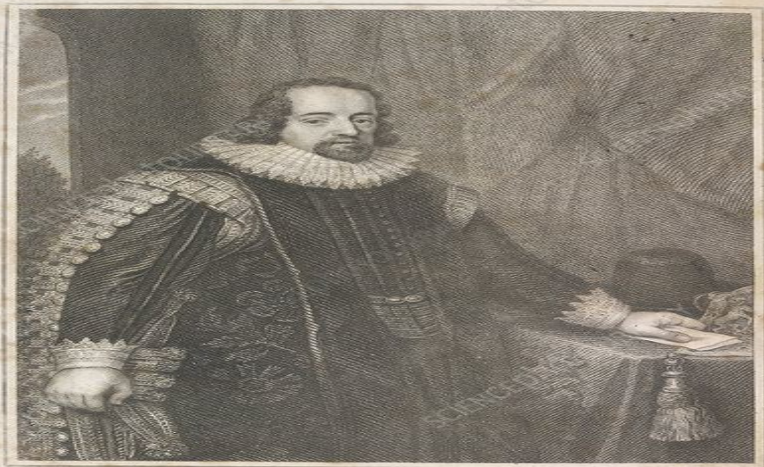
FRANCIS LORD BACON.