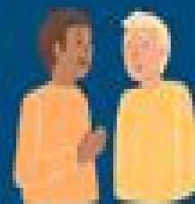
Family or couple therapy