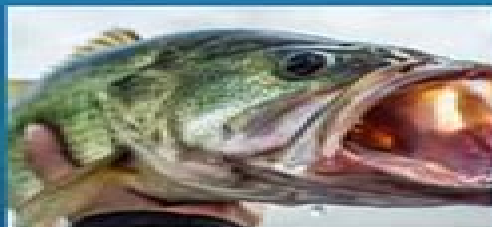
2. LARGEMOUTH BASS