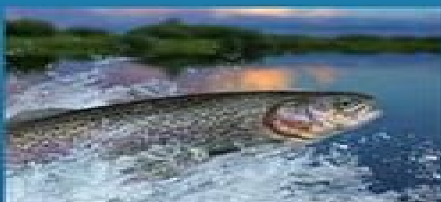
1. RAINBOW TROUT