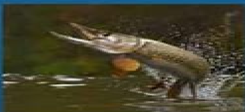
4. NORTHERN PIKE