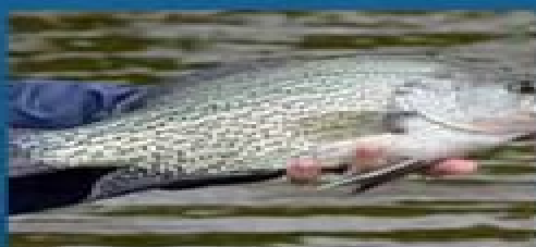
5. BLACK CRAPPIE