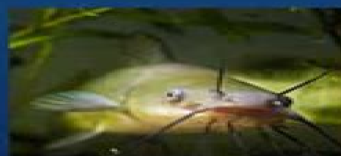
9. CHANNEL CATFISH