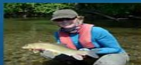
6. SILVER REDHORSE