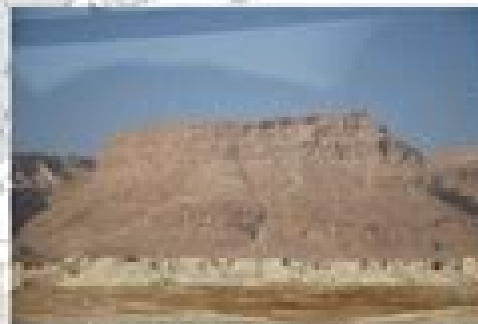
Masada at the Dead Sea Israel below sea level