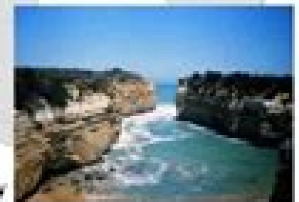
Strata at Ocean near Melbourne Australia at sea level

"Sediments and sedimentary rocks are confined to the Earth's crust, which is the thin, light outer solid skin of the Earth...the Earth's sediment sedimentary rock shell forms only about 5 percent by volume of the terrestrial crust...less than 1 percent of the Earth's total volume...(but) exposure of sediment and sedimentary rock comprises 75 percent of the land surface and well over 90 percent of the ocean basins and continental margins."