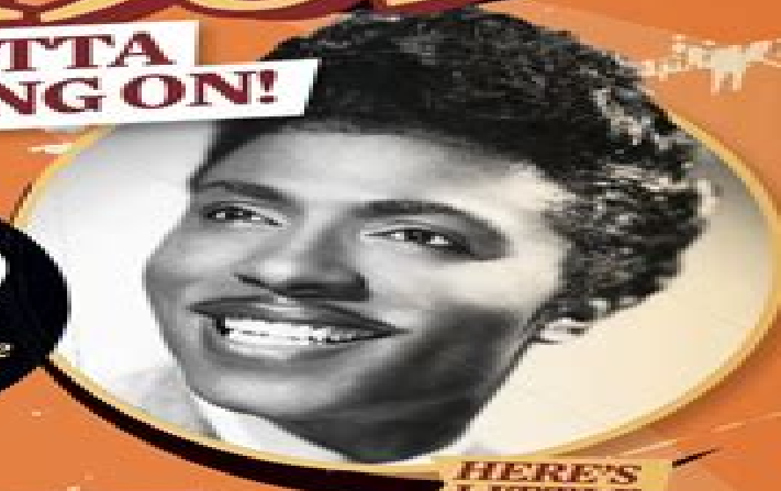
HERE'S LITTLE RICHARD Behind the scenes of a rock'n'roll classic

PLUS Carl Perkins ★ The Rock 'n Roll Trio ★ Billy Lee Riley ★ Cliff Richard ★ And more!