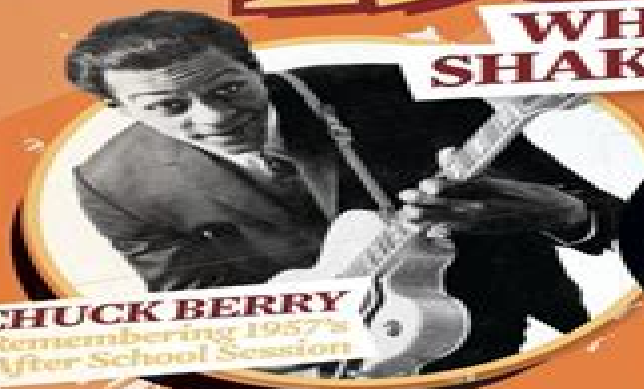
CHUCK BERRY Remembering 1957's After School Session