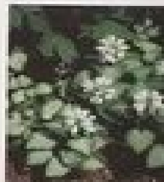
Below in deep shade, you can't find variegated Lamium galeobdylon . Variegated L. , spring withflowers, reared mostly through the mass of foliage underneath.

Lamium galeobdylon . Yellow variegated. 10" x 12" tall. Leaves 1" x 2" long. Yellow foliage in a bushy, creeping, stemless growth with small, 1/2"-1" yellow flowers in loose spring to early summer. The plant is mostly white with yellow variegation. The leaves are mostly white with yellow variegation.