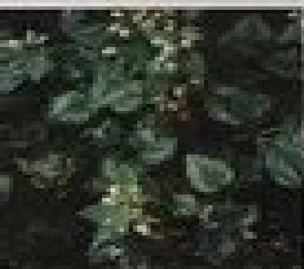
Below in deep shade, you can't find variegated Lamium galeobdylon . Variegated L. , spring withflowers, reared mostly through the mass of foliage underneath.

Lamium . Yellow Archangel. Foliage plant with spring blossoms. Partial to full shade.