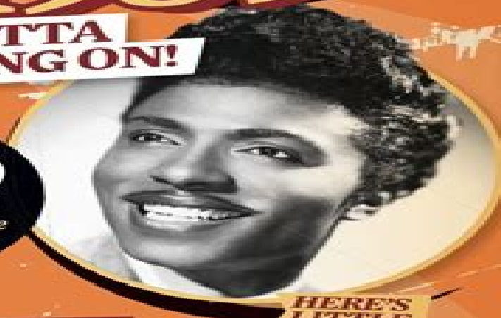
HERE'S LITTLE RICHARD Behind the scenes of a rock'n'roll classic

PLUS Carl Perkins ★ The Rock 'n Roll Trio ★ Billy Lee Riley ★ Cliff Richard ★ And more!