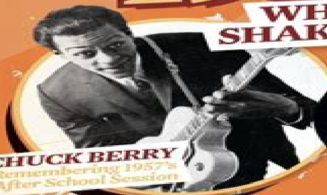
CHUCK BERRY Remembering 1957's After School Session