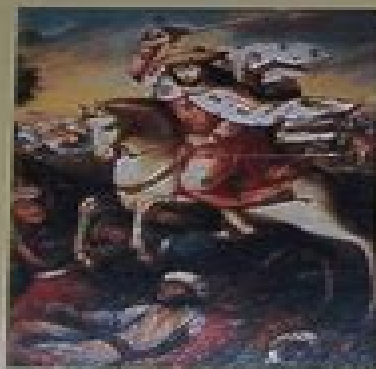
St. George and the Dragon, 1980, W. C. A. S. - 1980

- J. Carter Brown, RINGS exhibition director and Director Emeritus, National Gallery of Art, Washington, D.C.