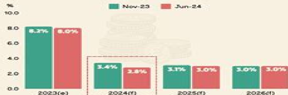
Contribution to growth by categories...