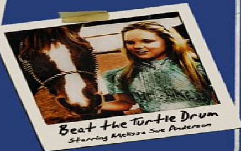
Beat the Turtle Drum Starring Melissa Sue Anderson