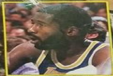
Los Angeles Lakers forward and former North Carolina star James Worthy