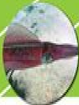
Caribbean Reef Squid