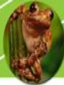
Gray Tree Frog