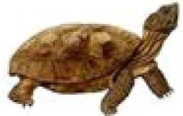
Tortoises and Turtles