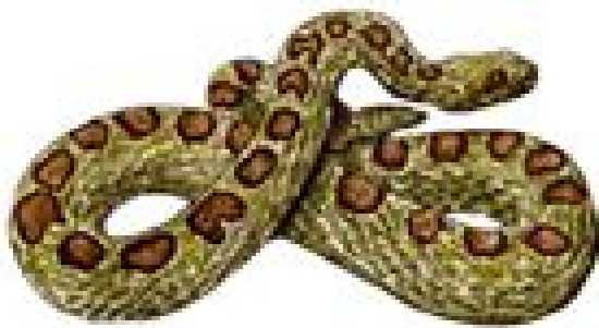
Snakes and Lizards