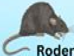
Rodentia (Rats, Squirrels)