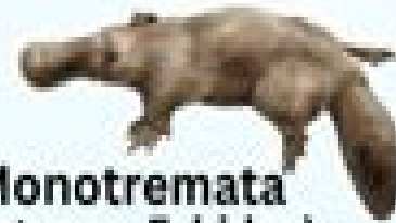
Monotremata (Platypus, Echidna)