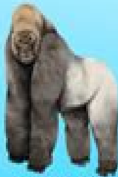
Primates (Humans, Apes, Monkeys)