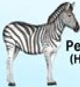
Perissodactyla (Horses, rhinos)