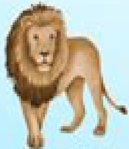
Carnivora (Cats, Dogs, Bears)

Mammals are warm-blooded vertebrates that have four limbs and hair and produce milk.