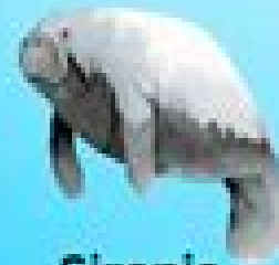
Sirenia (Manatees, Dugongs)