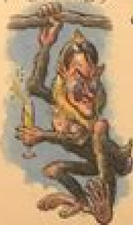
Mandyrill ( Mega suringa )