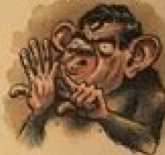
Gordzilla ( Killa gorilla )