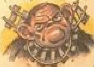
Chimp ( Chimpus chimps )