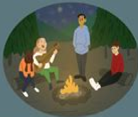
Wilderness: aims to help groups of kids with behavioral problems