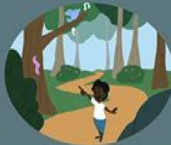
Forest: drawing attention to all 5 senses while walking through a forest