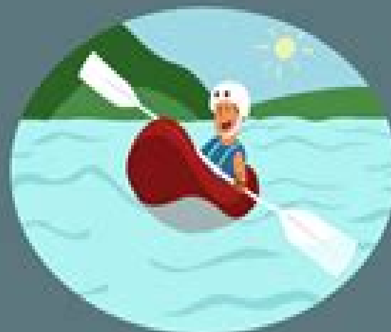
Adventure: includes nature activities like white water rafting