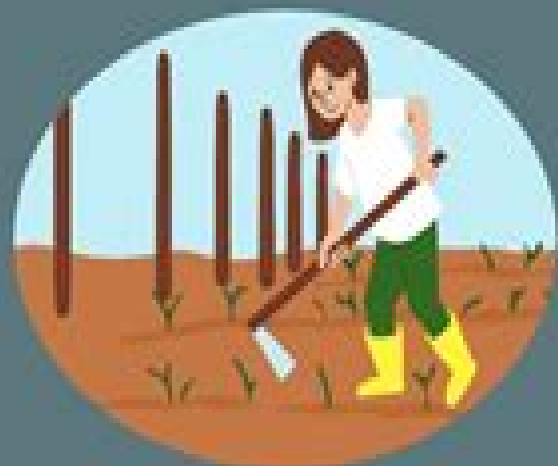
Farming-related: working with crops