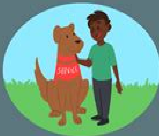
Animal-assisted: incorporates animals into play time