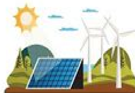
Wind Power and Solar Energy